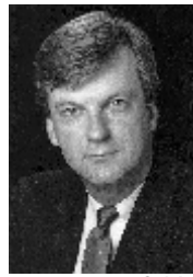
NDP Labour Critic Peter Kormos